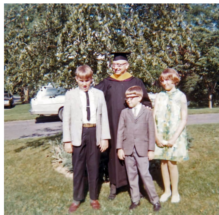
Dressed to receive MBA from Virginia Tech (ca. 1967)