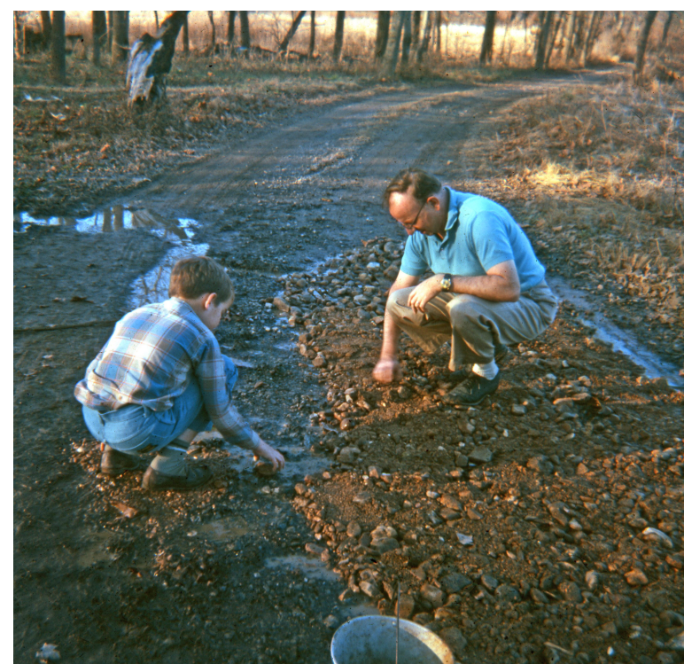
Filling potholes in the lane to the farm in Cadiz KY (ca. 1966)