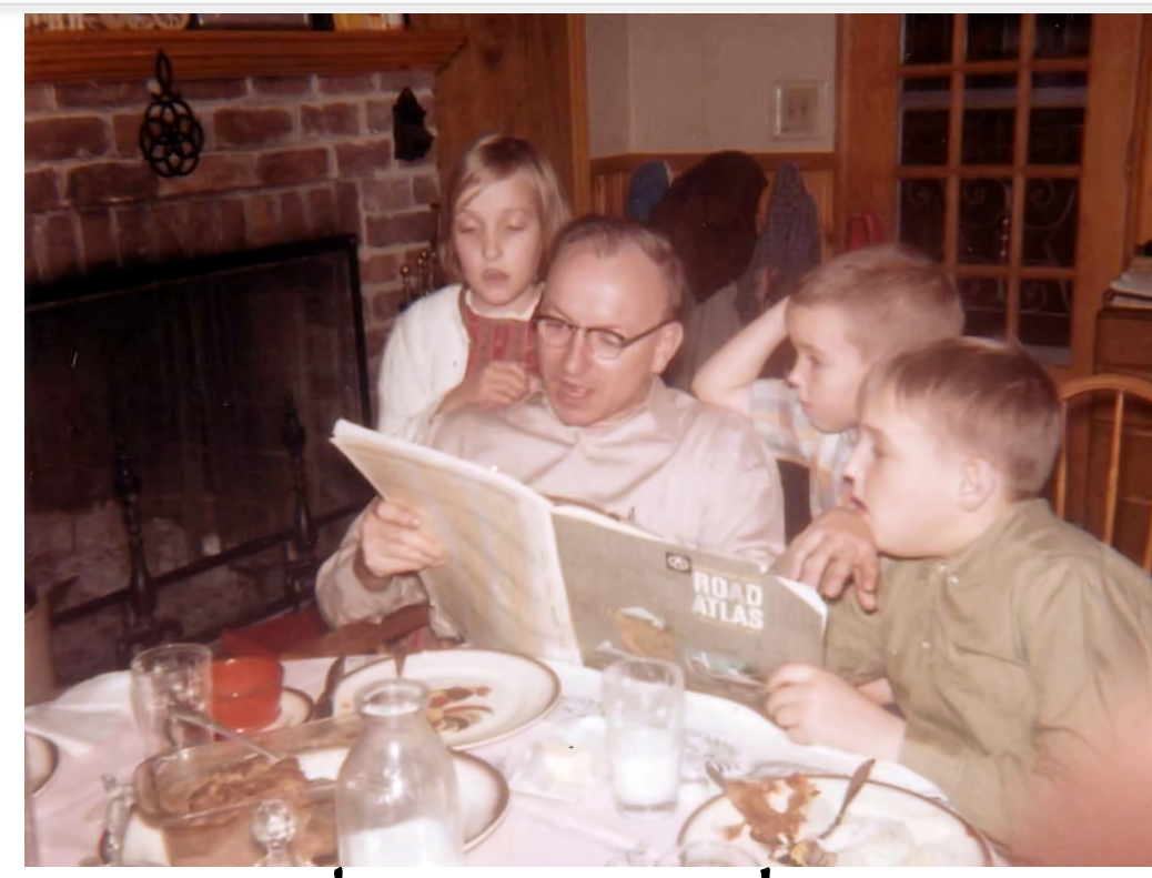
Planning a road trip with the children (ca.1965)