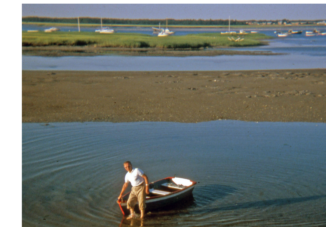
Pulling in the row boat after rowing out to Bluff Island and back – leaving on the morning tide as it went out, and returning with the tide in the afternoon (1980)