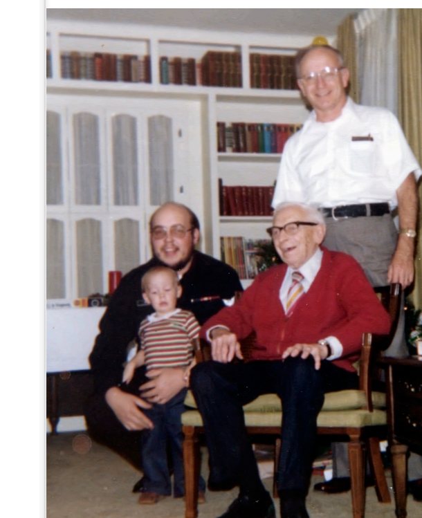
Four Howards (1978)